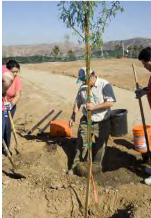
Volunteers plant trees using biosolids compost to build Orange County's largest California native plant-friendly demonstration garden in the city of Orange for O.C. CoastKeepers.

By improving soil health with compost, residents and landscapers also help to save water and improve local water quality.